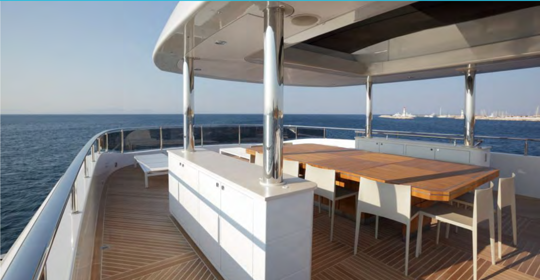
Table sitting 12 guests