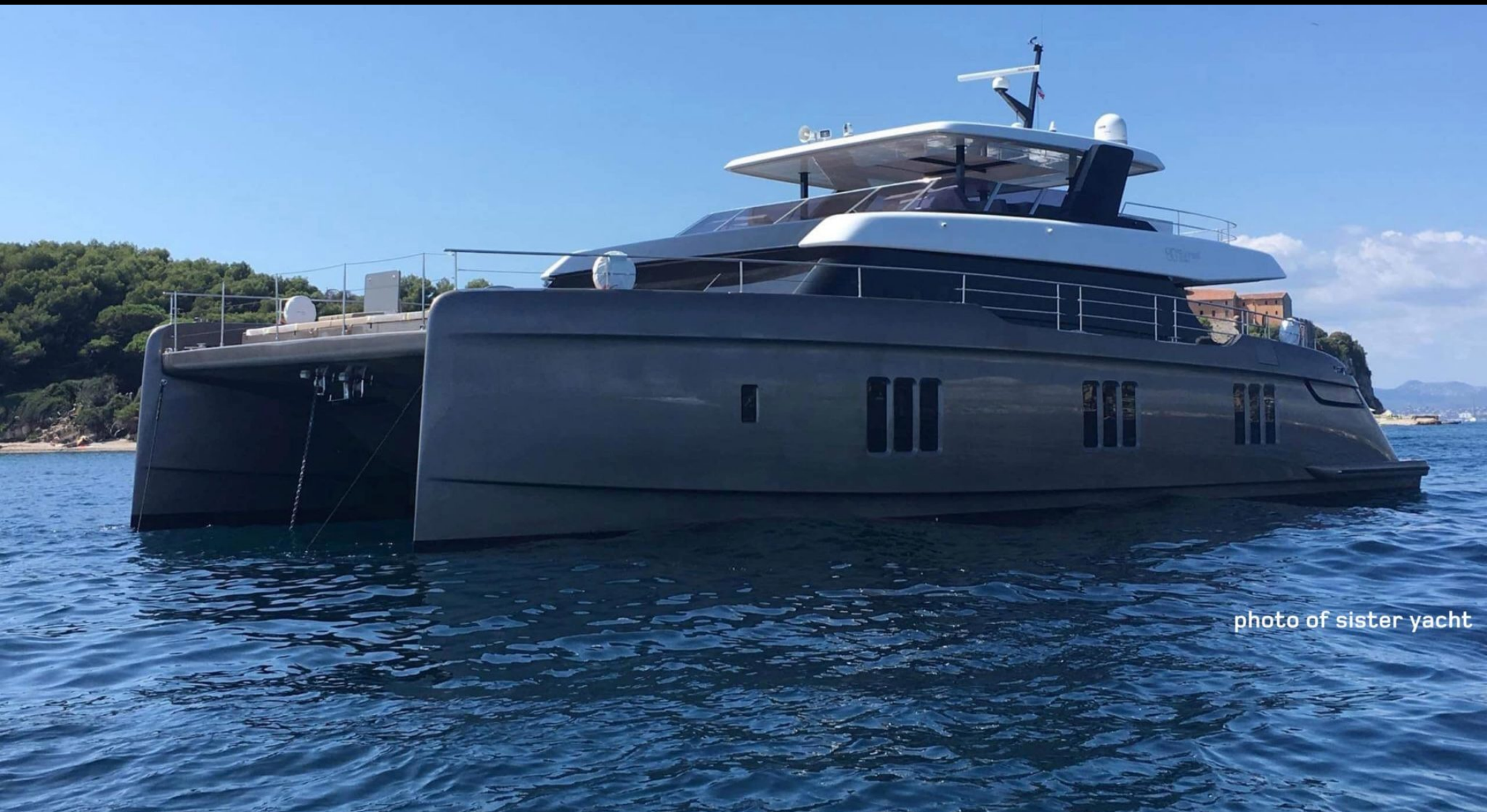
photo of sister yacht